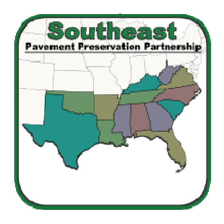
2010 Annual Meeting